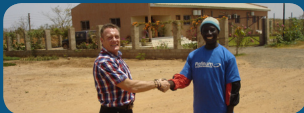
Platinum Director and local worker