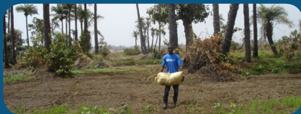
Moringa Oleifera seeds prior to plantation