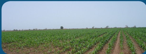
Moringa Oleifera Field